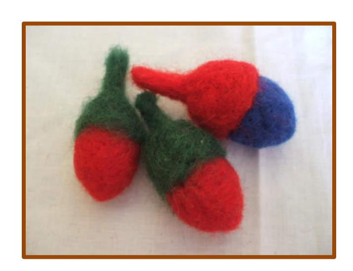
Try different colour combinations!

Needle felt all of the cup twisting the excess fleece together at the end to form the stalk. Needle felt the stalk and the acorn is finished.