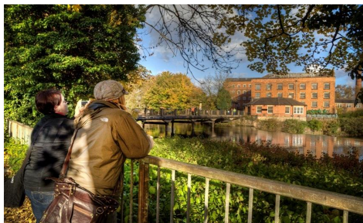
Darley Abbey Mills