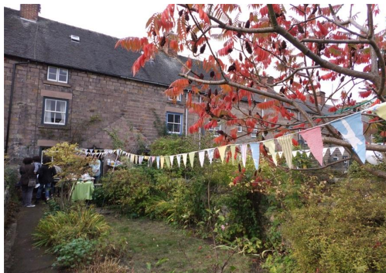
Berkins Court, Belper