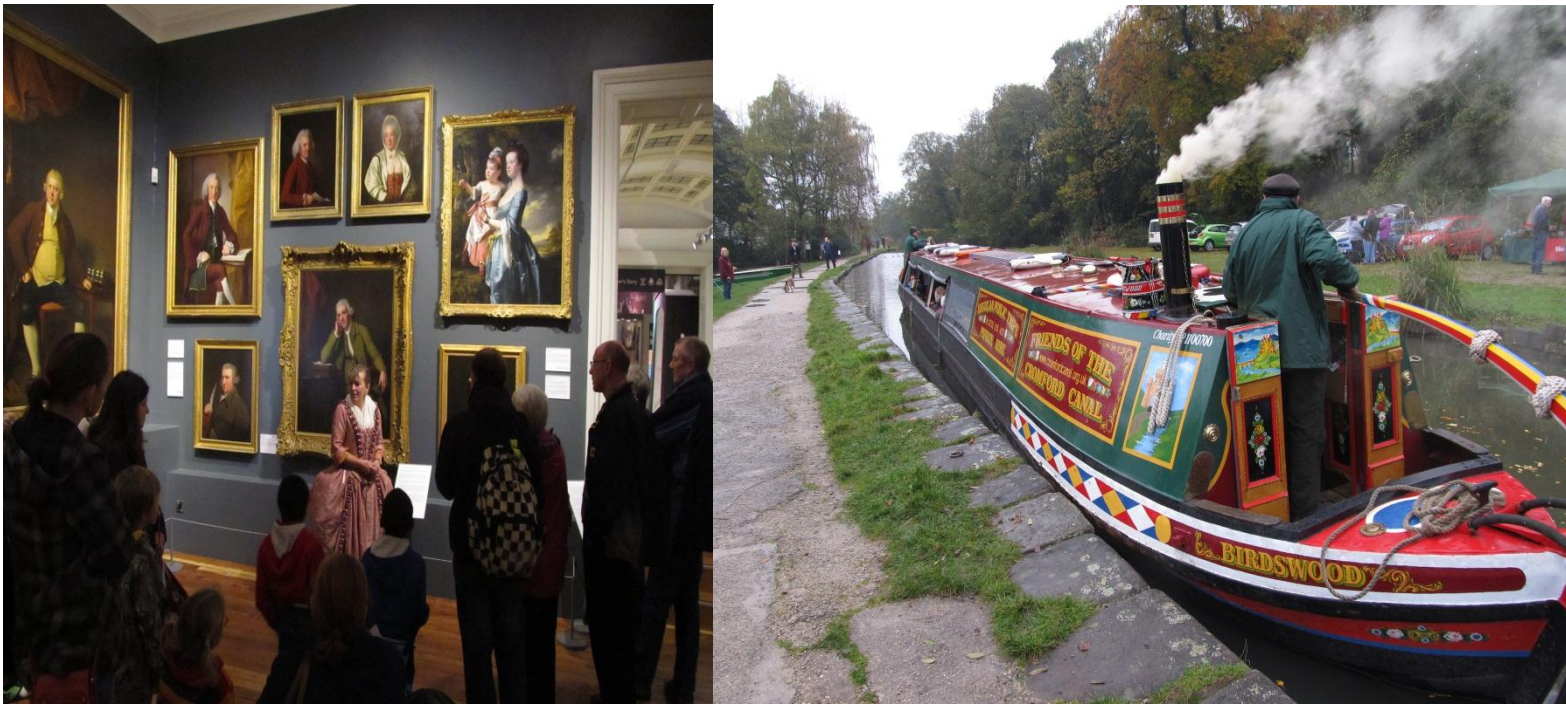
Discovery Days Events in Derby and Cromford