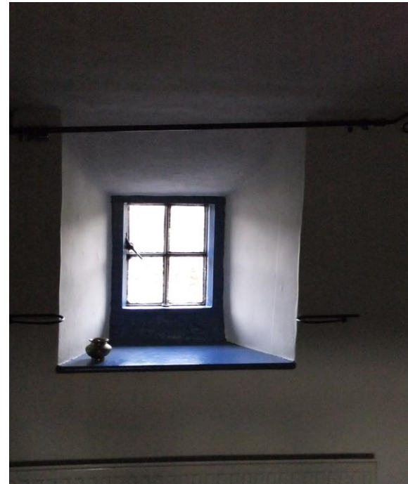
Window in house in Long Row, Belper