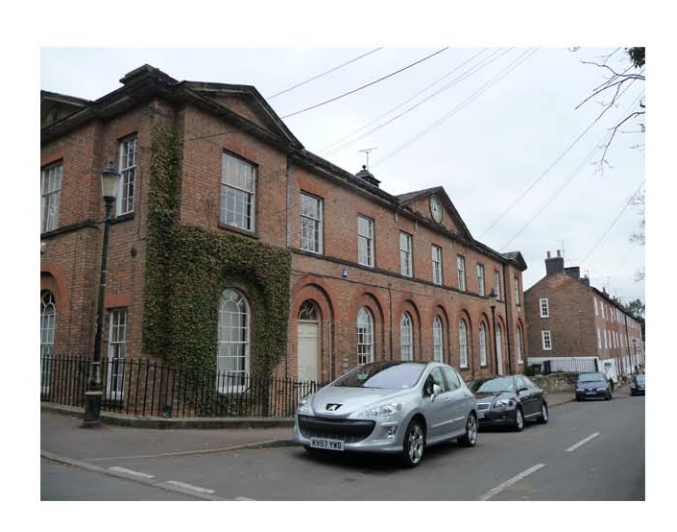
No significant change

Whilst some parts of the Evans' mill community has suffered from insensitive new development and unsympathetic changes to many of the millworkers houses, some parts have survived virtually intact, such as the school of 1826. Even the iron railings surrounding the playground have survived.