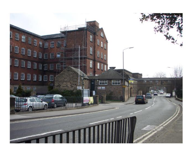
The scaffolding facilitated some very limited repairs, but the need for major repairs remain a Management Plan priority.

The footbridge has suffered extensive damage from tall vehicles. Bridge collision warning signs were installed in 2007 to reduce the risk of further damage, but whilst a busy A-road continues to go under the bridge, the risk remains.