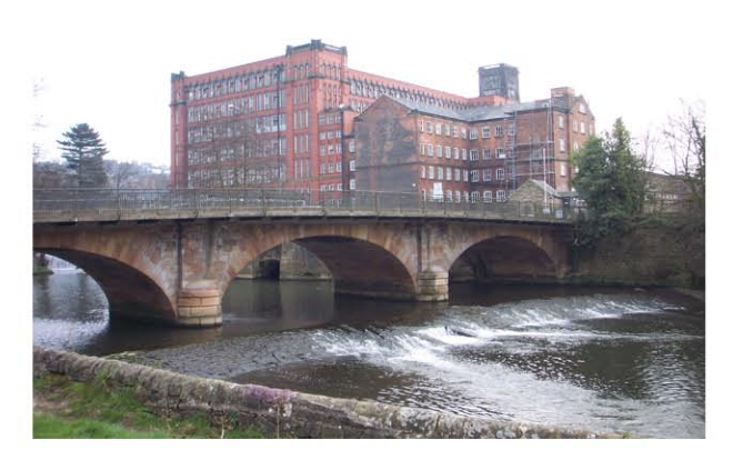
The weir in the foreground continues to collapse. Clarification of ownership is trying to be ascertained.

The poor condition of both mills and the weir are causes for concern.