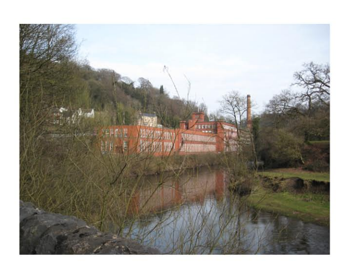
No significant change

It is desirable that the vegetation on both banks does not increase to the point that the viewpoint is further affected