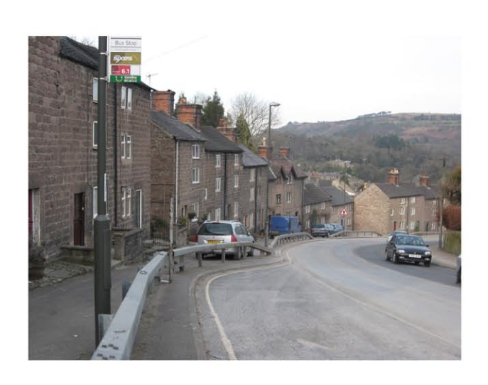
No significant change

The late 18th century and early 19th century millworkers' cottages which line Cromford Hill are an important part of the historic village. A number of the houses have inappropriate modern doors, windows and roof coverings and it is desirable these be replaced with more sympathetic alternatives based on historic patterns. The dramatic scenic setting is very important. The car parking and crash barriers are regrettable.