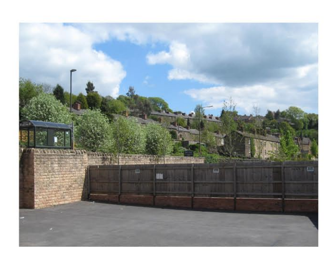
Continued development has made the recording of the scene more challenging.

Following the hillside contour lines, stacked one above the other, these terraces of early 19th century mill workers houses may be glimpsed from the A6.