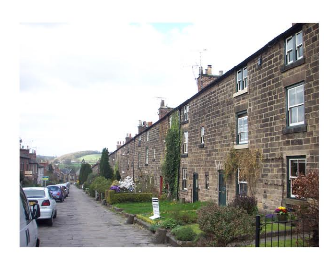
No significant change

Successive conservation area grant schemes have facilitated the reinstatement of lost architectural detail (windows and doors) to the houses.