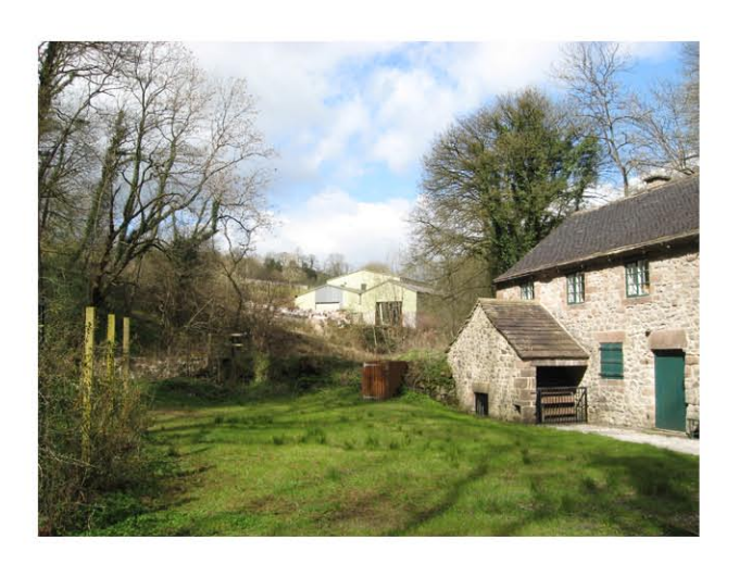
Slinter Cottage and millpond with Dunsley Mill behind.

This small Arkwright water mill is set in a deep valley dominated by Slinter Tor and faces the historic coppiced Slinter Wood. Behind the former mill is the modern industrial complex which stands on the site of an 18th century Arkwright mill called Dunsley Mill. It is within the Buffer Zone and impacts negatively upon the setting of this part of the World Heritage Site.