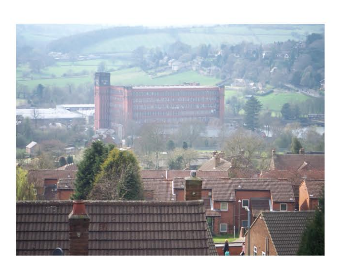
No significant change

It is because the land rises steeply to the east that this part of the town is included within the Buffer Zone, to ensure tall structures are not allowed to impinge negatively upon the setting of the World Heritage Site.