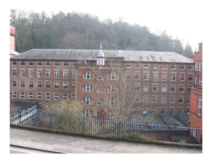
No significant change