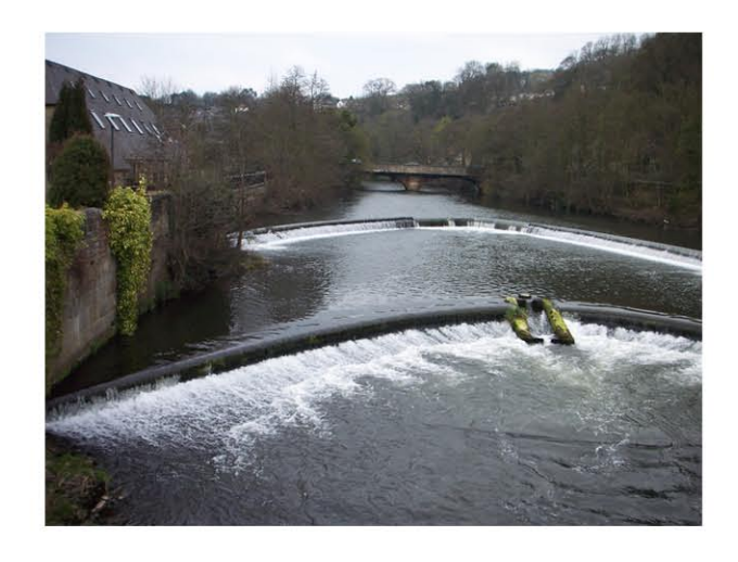
No significant change

Although the mills themselves have been lost at Milford the river weirs, mill leats, riverside retaining walls and even masonry wheel pits have survived and are of the greatest importance. The river bridge dates from 1793 and was widened twice in the 20th century when a toll house was lost.