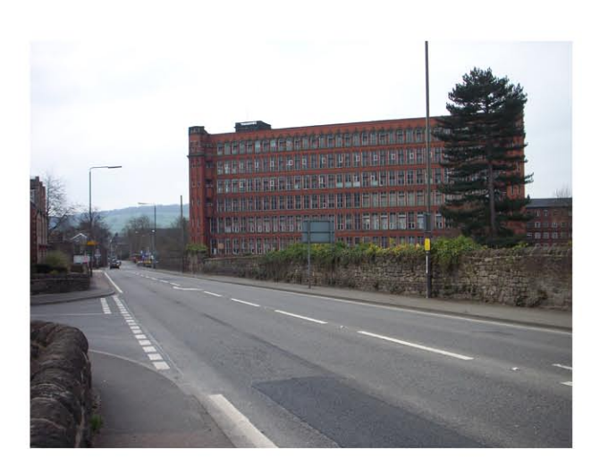
Although no significant change is visable to this landmark mill it continues to deteriorate. Removal of trees as part of the River Gardens renovations has improved the view of the East Mill.

The wall predates the mill and forms the boundary of the River Gardens. It was raised in the winter of 1905/6 to reduce the risk of falling for onlookers leaning over the wall. Vegetation has penetrated and damaged this wall.