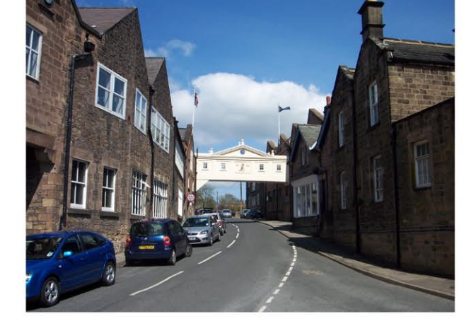
No significant change