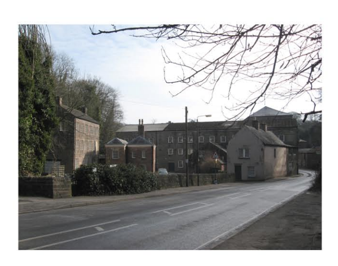
No significant change

Not in the view, because it was very badly damaged in a road traffic collision in 2002 is the cast iron conduit of 1821 which spanned the road and which needs to be repaired and reinstated.