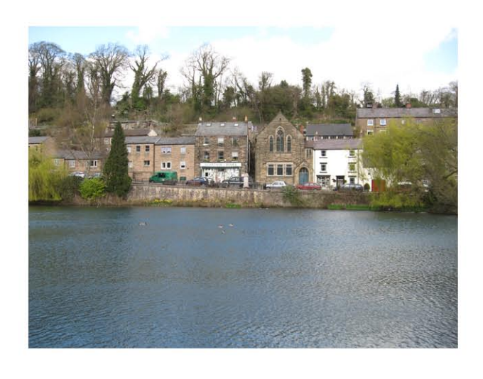
No significant change