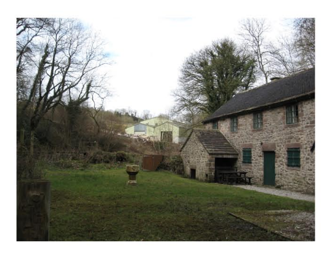
The planning application for the redevelopment of the Dunsley Mill site remains undetermined.

This small Arkwright water mill is set in a deep valley dominated by Slinter Tor and faces the historic coppiced Slinter Wood. Behind the former mill is the modern industrial complex which stands on the site of an 18th century Arkwright mill called Dunsley Mill. It is within the Buffer Zone and impacts negatively upon the setting of this part of the World Heritage Site.