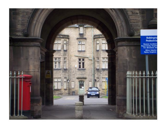
No significant change

The imposing frontage of the former Belper Workhouse was designed by Sir George Gilbert Scott. It was completed in 1840, and served as a workhouse until 1930, when it became a hospital, which it remains. Extensive changes were made between 1930 and 1941 and later in the 20th century, but the early-Victorian workhouse system is still apparent from the surviving frontage. It is good that it remains in institutional use which has required little change to its external appearance.