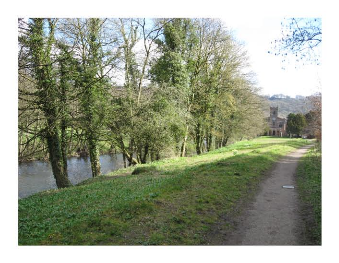
The Derwent riverbank looking towards St Mary's Church.

This was originally part of Willersley Castle's Park, landscaped for Richard Arkwright I & II by John Webb. Early engravings reveal that the design concept was of riverside meadows with scattered groups of ornamental trees, but hardly any riverbank trees. It is desirable for the original design concept to be reinstated, giving the church back its original setting. The unspoilt dramatic landscape setting is of immense importance.