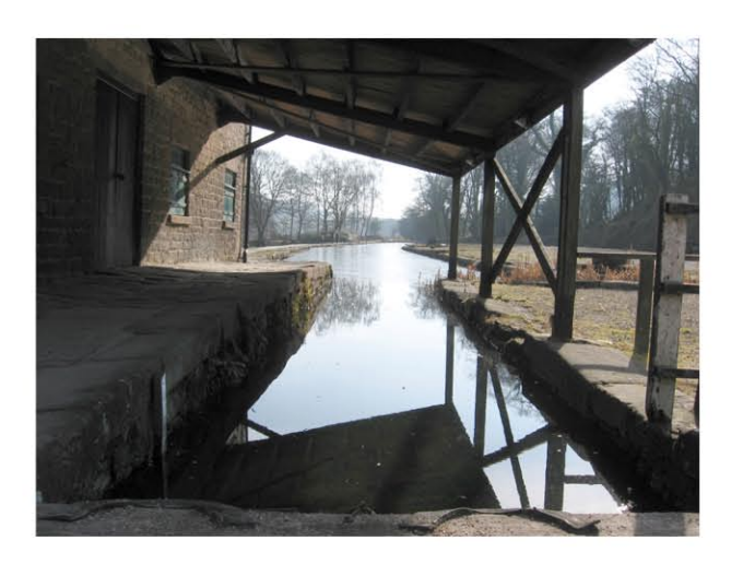
No significant change

Although the scene owes much to natural beauty it is important that the industrial origins of the wharf are effectively interpreted and that the wharf yard is not encroached upon by vegetation.