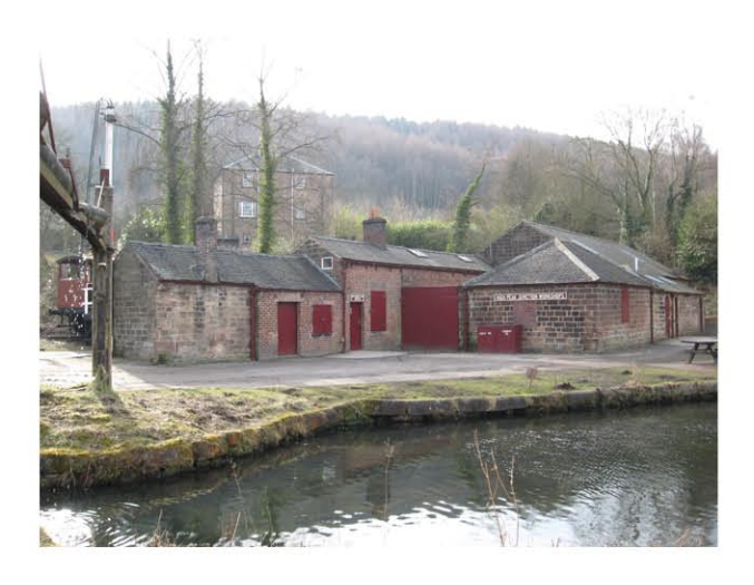
No significant change