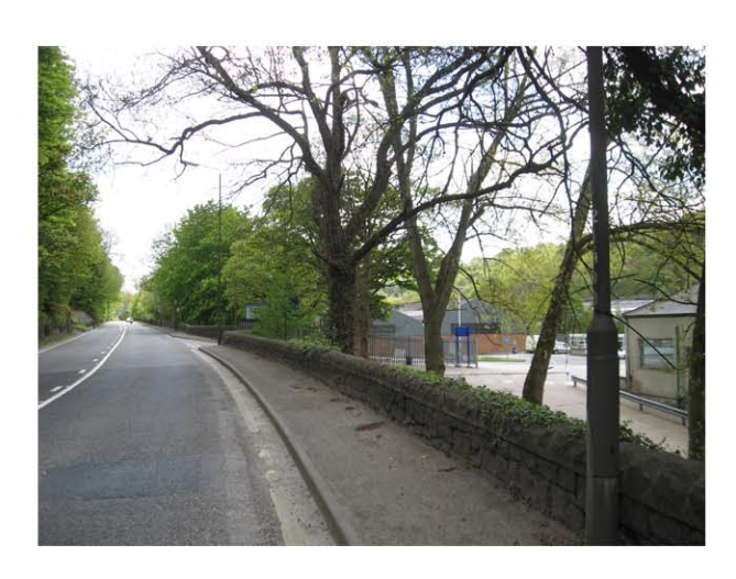
No significant change

The site formerly occupied by Johnson and Nephew Wireworks and now by Litchfield Plastics is extensive and contains the archaeological remains of an 18th century blast furnace. The modern industrial buildings are low key and to some extent screened by roadside trees but if redeveloped the site could have a major visual impact upon this part of the World Heritage Site. On the opposite of the A6 is Mold's Wharf, on the Cromford Canal. The roadside wall contains much industrial archaeology.