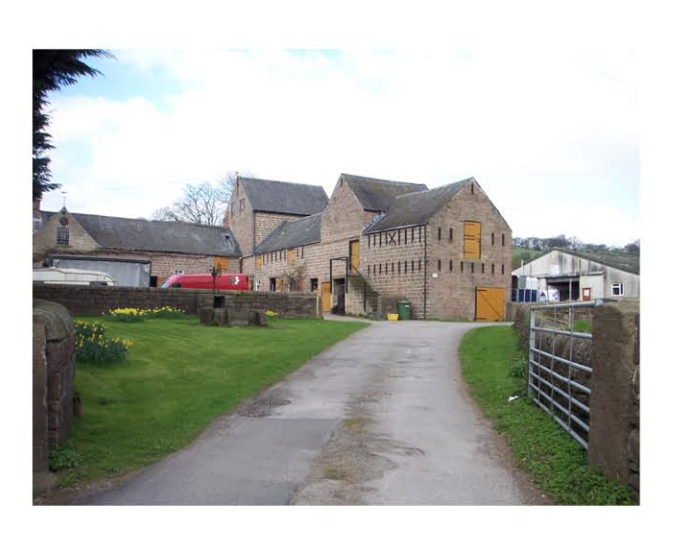
No significant change

As the economic realities of agriculture change, more and more of the Strutt farm buildings are likely to become unsuitable for modern agricultural use. A major challenge is to find new sustainable uses which are compatible with preservation of their character and appearance.