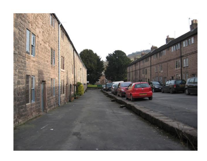
No significant change

The nature of the original paving has been researched and it is hoped it may be reinstated at some point. The absence of street clutter is an important quality. It would be preferable if some alternative site for resident's car parking could be found. The yew trees in the garden of the 1832 school are important.