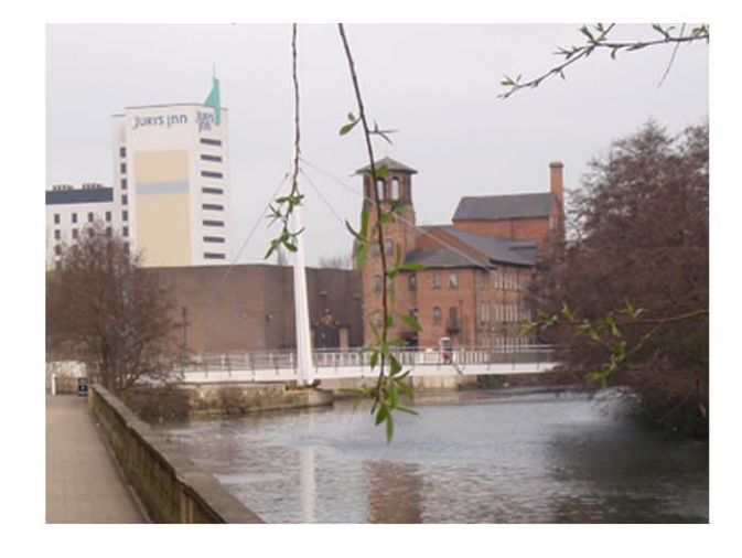
No significant change