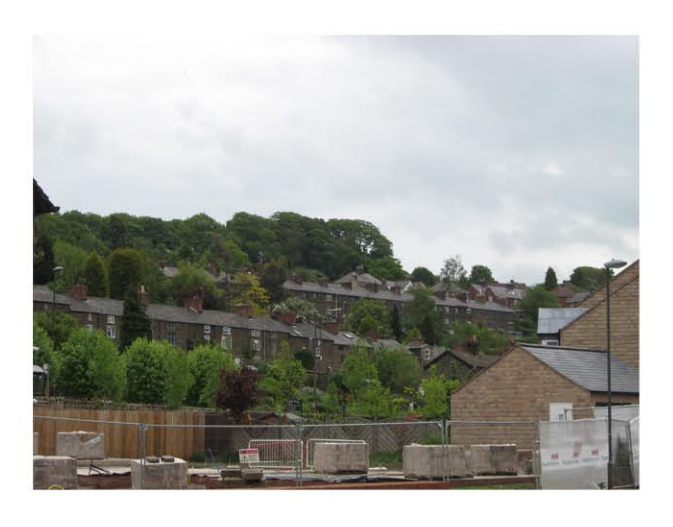
Hopping Hill terraces, Milford.

Following the hillside contour lines, stacked one above the other, these terraces of early 19th century mill workers houses may be glimpsed from the A6.