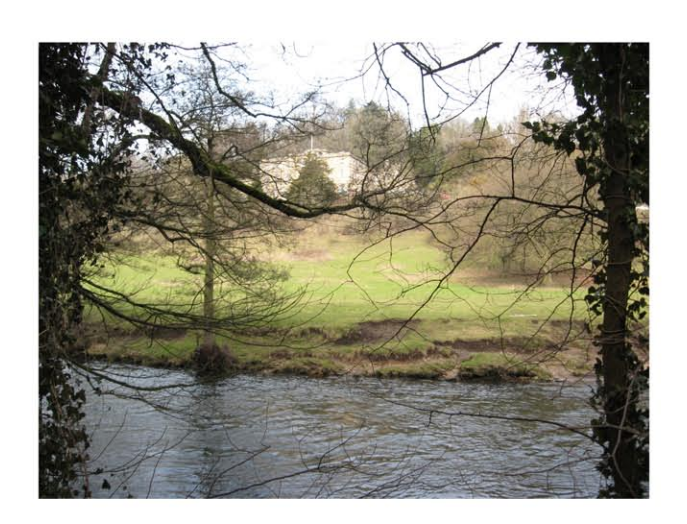
No significant change

The damaging effect of unmanaged riverbank tree encroachment into the designed landscape of Willersley Park is very obvious in this view. In the summer the castle is completely screened from view.