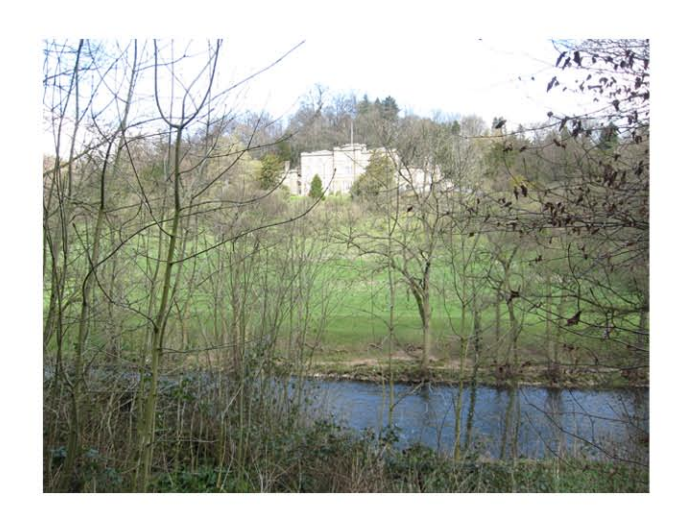
Willersley Castle and Park from the south bank of the River Derwent.

The damaging effect of unmanaged riverbank tree encroachment into the designed landscape of Willersley Park is very obvious in this view. In the summer the castle is completely screened from view.