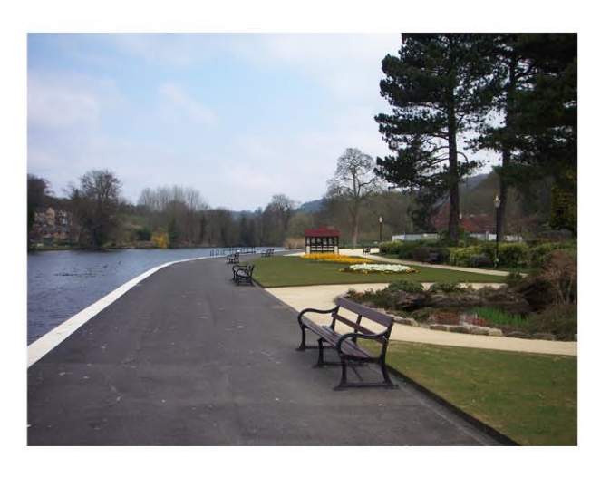
Work in the River Gardens has been completed. The newly built promenade has now been surfaced and seating put back.

During the creation of the formal gardens in the winter of 1905, a stone wall was discovered 54 inches below the river level. Strutt ordered this be raised and capped with concrete, and material dredged from the river and placed behind it, creating a promenade at the water's edge. This provided an accessible way of enjoying river walks and boating on the water. The wood pylons used to widen the promenade in the winter of 1906 have now rotted and urgent works were agreed in 2008 by present owners Amber Valley Borough Council to rebuild this section of the Gardens