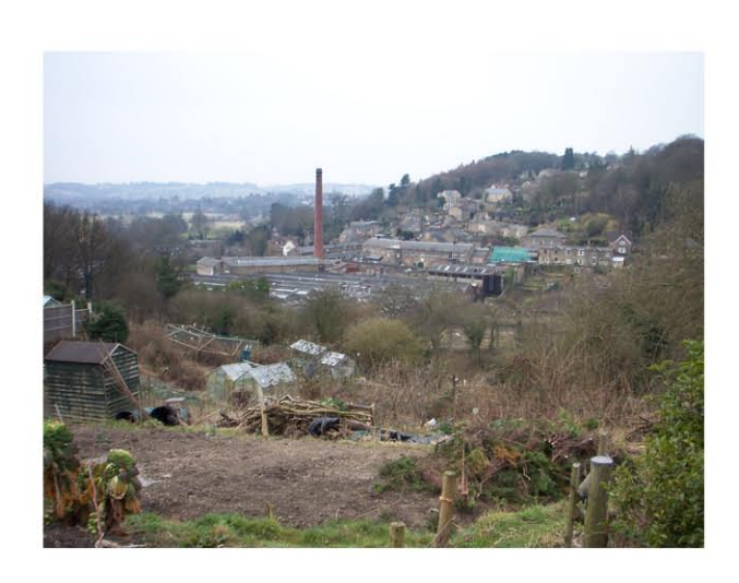
No significant change

The most important Strutt millworkers housing in Milford is in the form of terraces, some 'back to back' which follow the contour lines of the steep valley side. Although nearly all the mills buildings have been lost those structures that do remain are of great importance and the mill chimney, although 20th century is a major landmark. This view has, in the foreground, allotments, which were an important part of the domestic economy of the mill community in the 18th and 19th century. The view from here cannot be too dissimilar to that seen in the early 19th century.