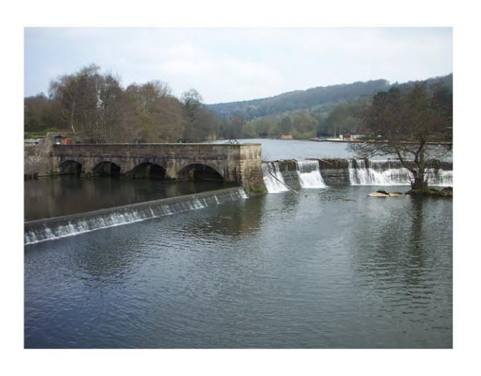
No significant change

Debris frequently collects at the weir, necessitating close management to prevent damage and ensure this iconic Belper view remains pleasing to visitors and residents.