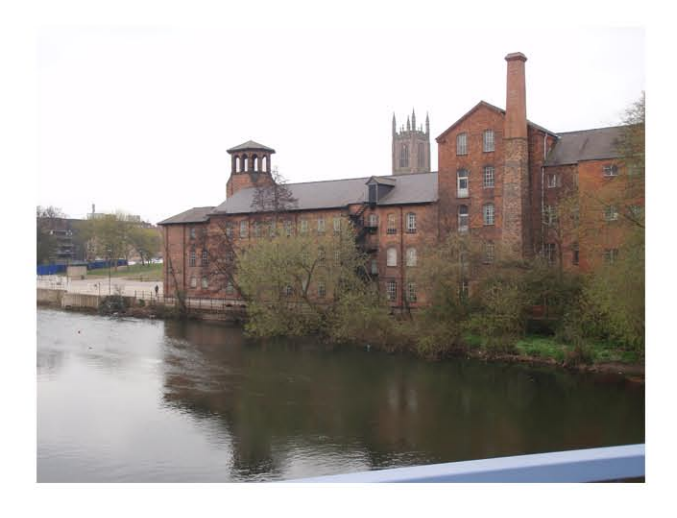
Silk Mill from the St Alkmund's Way flyover bridge.