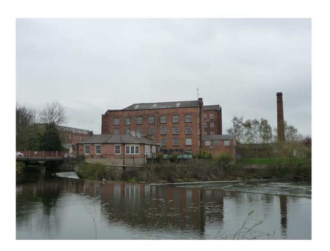
The viewing platform across the river from the mills has been much improved by the removal of vegetation.

The ensemble of mills and ancillary buildings at Darley Abbey are seen well from this viewpoint on the east riverbank. The weir is an essential part of this ensemble, and needs to be carefully conserved.