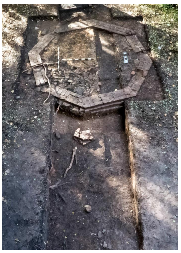
Figure 3 -- The Game-larder exposed

Trench 1 quickly revealed the octagonal red-brick foundations of a building above ground rather than below, as was expected for an Ice-house, but exactly where the maps had indicated.