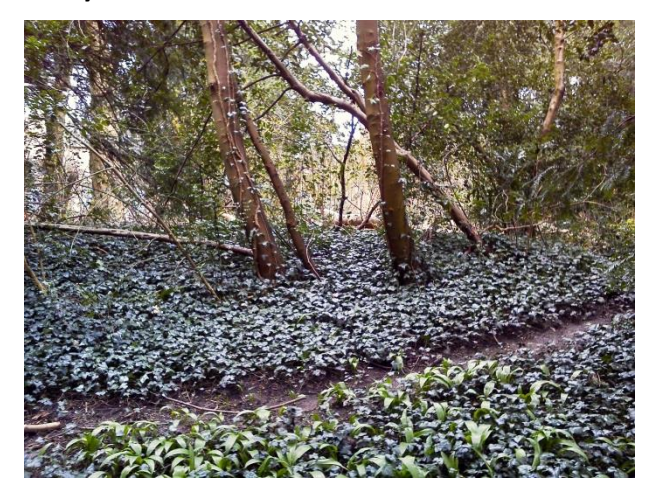
Figure 1 -- The Ice-house Mound

Historical Group (DAHG) has investigated the history of the Darley area, to record and compile the resources of the village and its people. This research has revealed built features, which point to the location of the Abbey of Darley, whose existence is recorded from AD 1140 to 1538, but of which the exact site is 'lost'. Excavations in 2007 at The Barn Centre revealed monastic foundations. It seemed pertinent therefore to excavate the Darley Hall Ice-house, which might reveal more Abbey ruins.