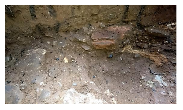
Figure 5 -- The 'Drain' stone-work

Trench 5 cut to explore a 'dowsed drain from the stone circle', reached mixed stone and base rock at ~1m. depth (Figure 5 below). Again this was left for a possible future investigation.