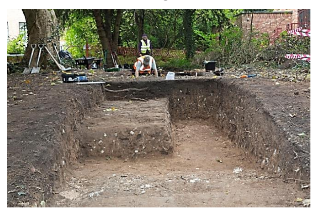
Figure 4 -- Showing the 'Circle of Stones'

Trenches 2 & 3 did not reveal features, contrary to the resistivity survey. In Trench 4 a lightcoloured 'circle of stones' was exposed, as found in Dowsing surveys, but this was considered an insubstantial feature (see Figure 4); maybe one for a future DAHG investigation?