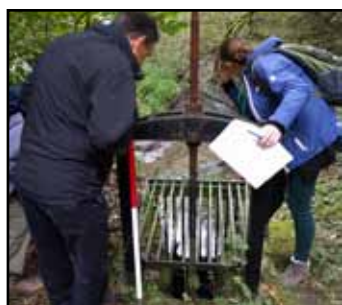
CLEARING OUT: Volunteers take a look at the Slinger Mill sluices.

A community clearance day was held in November 2017 to help with the upkeep of the site.