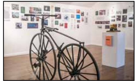
'Energetic' and 'Pictures of Power' ran at Pickford's House until February 10.

These two exhibitions will have a long lasting impact at Derby Museums and help to inform the future exhibitions at all Derby's museum sites, in particular the development of the new Museum of Making, scheduled to open in 2020.