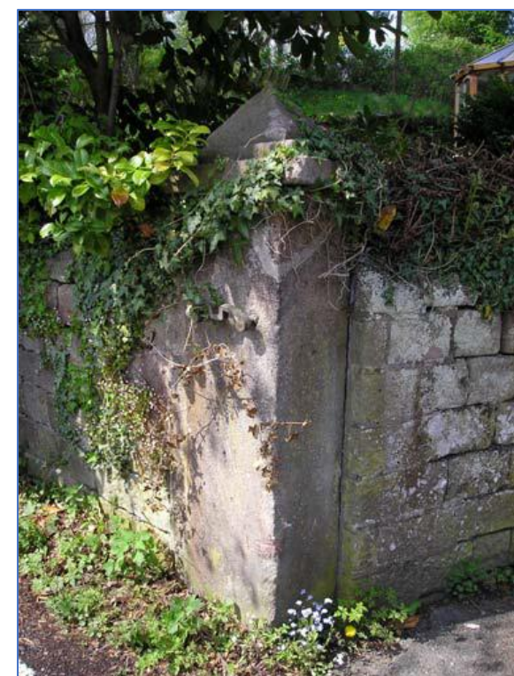
Left hand gate pier