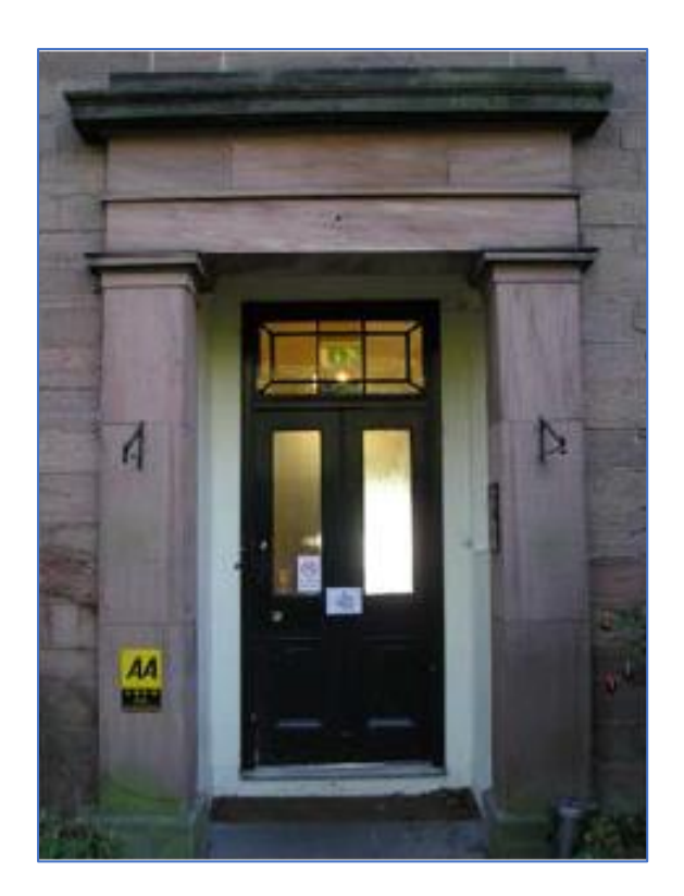
The entrance to Oakhill

It would seem the principal elevation was originally either the southern or the eastern one. It is difficult to be sure now as the original south front has been lost. The two principal rooms face east, as at the Vicarage, but the sash windows are not the showy Vicarage full height tripartite type, but are conventional six over six sashes, set within ordinary reveals ie without architraves. The smaller scale of the ground floor windows in the east wall of Oakhill is compensated for by there being two to light each of the two principal rooms. The room on the southern side is lit by a third, within the south wall. This gives the room a very pleasant quality, which is further enhanced by views down the Derwent Valley, through the two windows in the east wall.