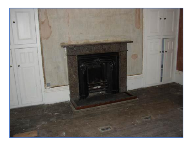
Polished fossilferous limestone fireplace with flanking cupboards within the room in north west corner of the original house

The original use of the ground floor rooms is not clear but the room in the north west corner of the original house was perhaps a study/office.