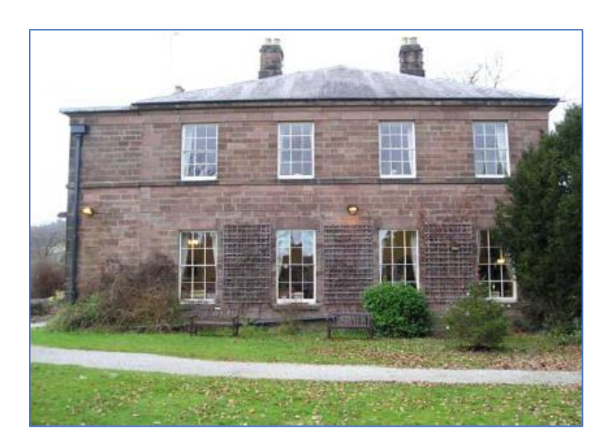
The east elevation of Oakhill

At first built the extension incorporated a garden door, in the second bay from the corner of the house. <sup>20</sup> This was replaced by a window, perhaps when what the 1964 sale papers describe as a 'sun loggia' was created. This was simply a recess within the rebuilt wall, accessed via sliding glazed doors. It was later done away with when a glazed bay window/conservatory was built over the opening. The room it lights had by the 1970s become the dining room but would seem to have originally been the morning room. It is now a lounge. It has a fine polished fossilferous limestone fireplace. The first extension increased the length of this room from 14' to 23' and the bay window further extended it to 31'.