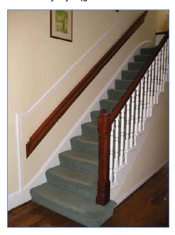
The staircase at Oakhill

The age and character of the house is much more obviously Victorian when seen from inside, with the doors being four panelled and the staircase having markedly 19<sup>th</sup> century style (gothic rather than classical) newel posts.