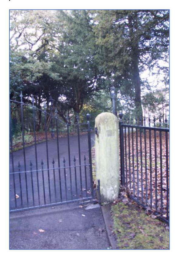
Gate post to the Vicarage

The carriage drive has square section stone gate posts with chamfered corners commanding the east and west entrance points to the Vicarage garden. Modern metal gates and garden railings were installed in 2008 but they are in the original positions.