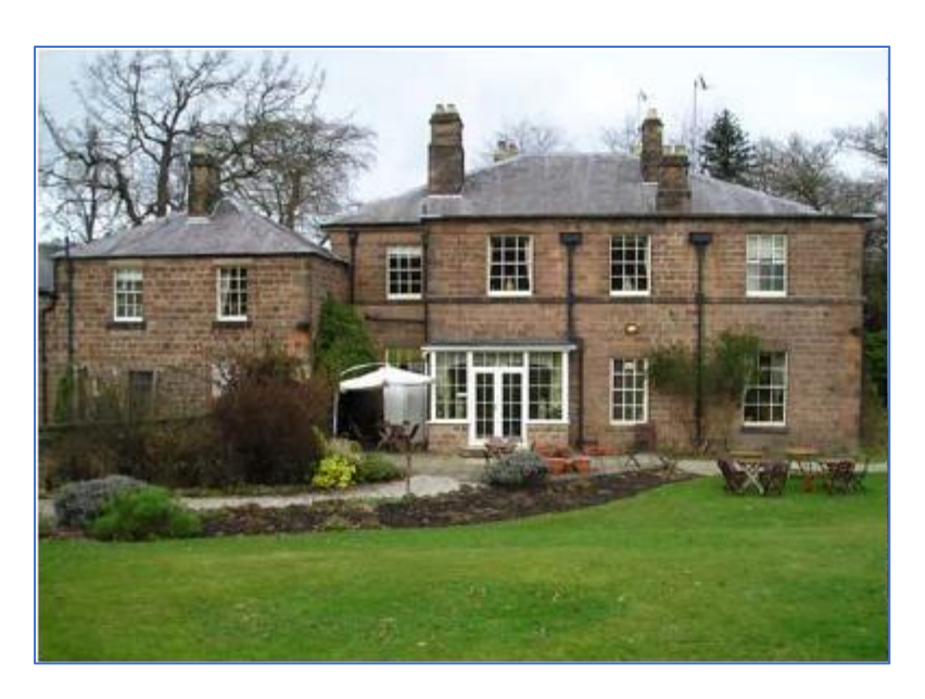
South elevation of Oakhill