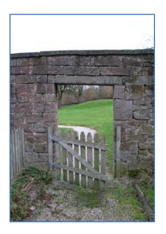
Gateway through garden wall

On the south side of the garden a tennis court was laid out, on a raised platform, but this was abandoned and given over to vegetables as part of the war effort.