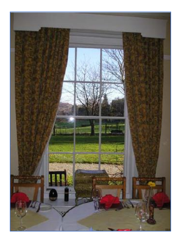
An east facing window in the former drawing room of Oakhill

As at the Vicarage the two principal rooms were (originally) of identical size, and of very similar dimension to those at the Vicarage, being 19' 0" x 15' 3" (as compared to the Vicarage 19' 6" x 14' 6"). The one on the south side was the drawing room. The other is described in the 1924 sale papers as "hall; dining room", a remarkably archaic arrangement for a house of this date. The two rooms are now conjoined, by means of the insertion of an elliptically headed opening within the dividing wall. The original drawing room has a nicely detailed painted wooden fireplace, with a reeded frieze and below it a central framed cartouche of carved leaves. This fireplace is probably the original.