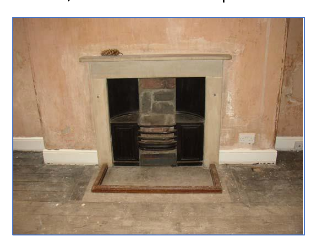
Sandstone fireplace within the entrance hall/the room to the left of the entrance door

The entrance hall is essentially square, 16' 6" x 16' 6", with the principal staircase in a broad corridor leading off it. A service staircase is located at right angles to the corridor, within an enclosed space.