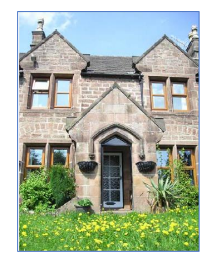
The former Lodge House