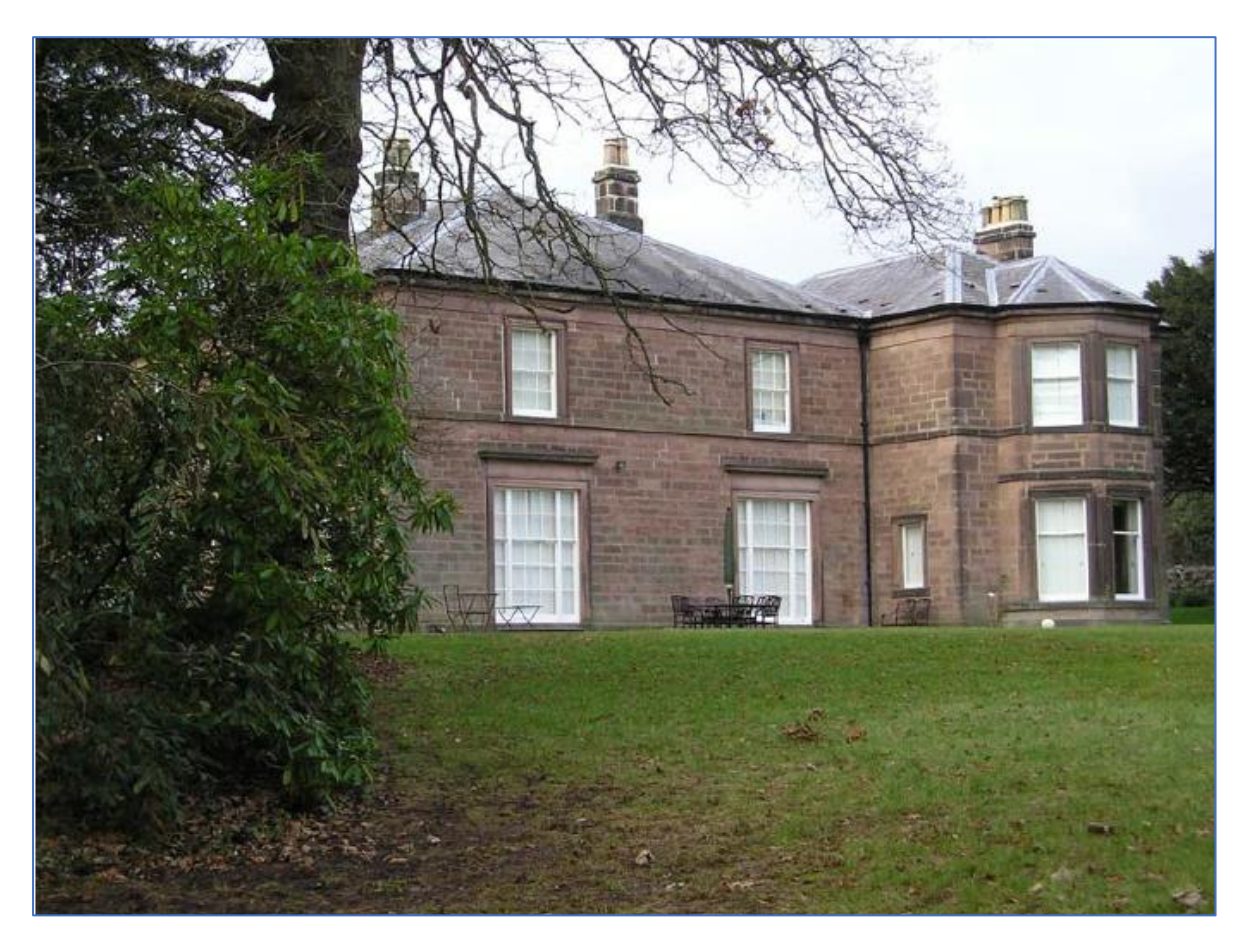
The east elevation of The Vicarage