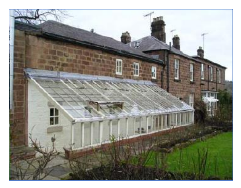
South elevation of Oakhill

The 1924 sale papers give the following description of the property: