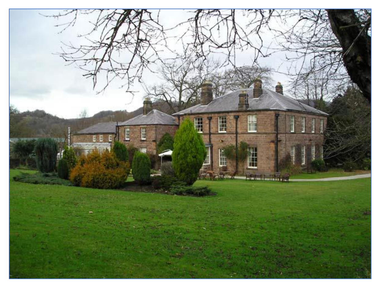
Oakhill from the South East