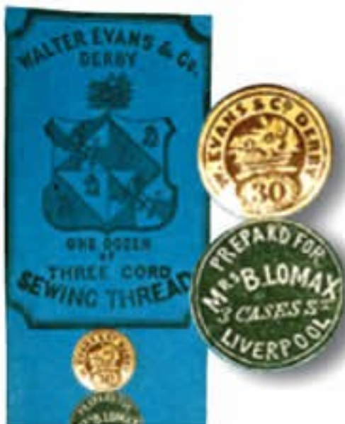
Box and Bobbin Labels

Evans had agents in London, Manchester, Blackburn, Leicester and Nottingham and travellers who covered other centres such as Birmingham. Their brand name, Boar's Head, a name suggested by the family coat of arms which included a boar's head, was in use by the middle of the century. Boar's Head thread was exported all over the world except to those markets where a porcine image might be culturally offensive. In these cases alternative brand names were used.