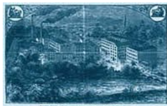
Boars Head Mill in 1862