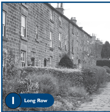
1 Long Row

Long Row is a second phase of millworkers' housing built about 1790 by the Strutt family. The rows of houses on the left and at the bottom right have a continuous roofline with an extra storey; built of gritstone and interlock around the staircase. The brick houses on the right ascend in stepped pairs. All these houses have ample gardens.