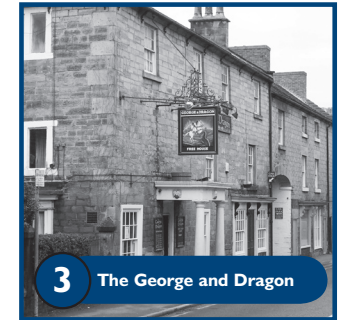
3 The George and Dragon