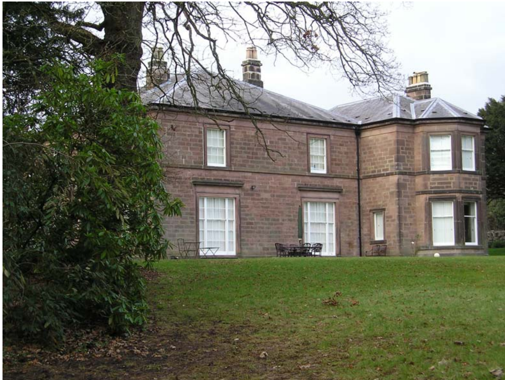
THE EAST ELEVATION OF THE VICARAGE

Richard Arkwright II held the gift of the living of St Mary's Church and as patron appointed the 'vicar' or, as was at first the case, the 'perpetual curate', as the incumbent clergyman could not claim the title of vicar until 1869 when St Mary's Cromford became a parish church. For the same reason it was not until then that the house could be called the Vicarage. Early references to the two houses describe them both as 'Oakhill', which was presumably simply the name given to the location.