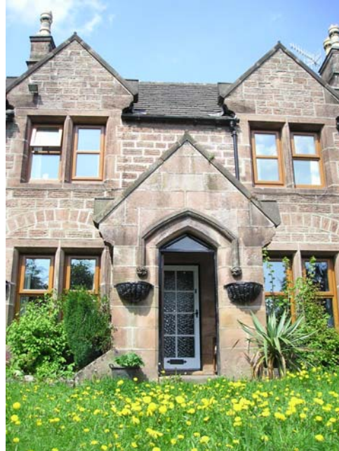
NOW KNOWN AS LYNTREE HOUSE

On its south side is a double entrance, one to the field behind the cottage and the other to the Oakhill residences. The central gateposts have been removed, making one wide entrance.