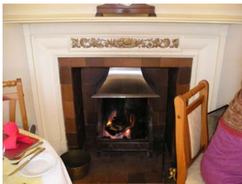
THE FIREPLACE OF THE FORMER DRAWING ROOM AT OAKHILL

As at the Vicarage the two principal rooms were (originally) of identical size, and of very similar dimension to those at the Vicarage, being 19' 0" x 15' 3" (as compared to the Vicarage 19' 6" x 14' 6"). The one on the south side was the drawing room. The other is described in the 1924 sale papers as "hall; dining room", a remarkably archaic arrangement for a house of this date. The two rooms are now conjoined, by means of the insertion of an elliptically headed opening within the dividing wall. The original drawing room has a nicely detailed painted wooden fireplace, with a reeded frieze and below it a central framed cartouche of carved leaves. This fireplace is probably the original.