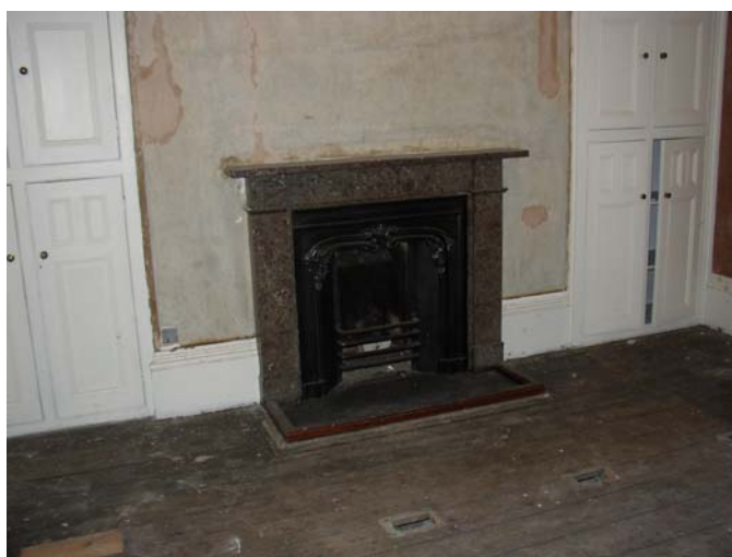
POLISHED FOSSILIFEROUS LIMESTONE FIREPLACE WITH FLANKING CUPBOARDS WITHIN THE ROOM IN NORTH WEST CORNER OF THE ORIGINAL HOUSE

The original use of the ground floor rooms is not clear but the room in the north west corner of the original house was perhaps a study/office.