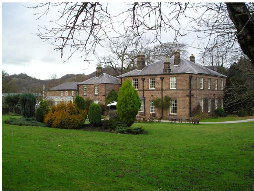
OAKHILL FROM THE SOUTH EAST