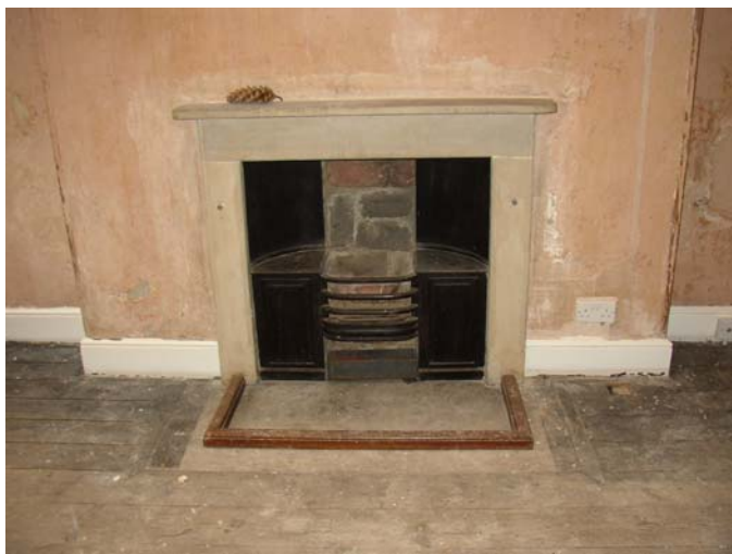
SANDSTONE FIREPLACE WITHIN THE ENTRANCE HALL / THE ROOM TO THE LEFT OF THE ENTRANCE DOOR

The entrance hall is essentially square, 16' 6" x 16' 6", with the principal staircase in a broad corridor leading off it. A service staircase is located at right angles to the corridor, within an enclosed space.