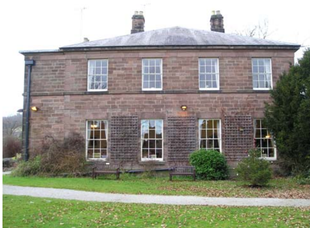
THE EAST ELEVATION OF OAKHILL

Divining the date of the house from the exterior has been further complicated by a major 20 th century alteration to the south elevation, which has given it three advanced bays, which are a two storey flat roofed extension. This was probably added during the occupancy of George Key. It was carefully done with matching stone and matching architectural detailing. In fact it would seem that a three bay length of the original south wall was dismantled and simply rebuilt 8' 0" further out, with even the original sash windows being reused. The 8' deep extension increased the length of the southernmost principal room, originally the drawing room to 27' 3".