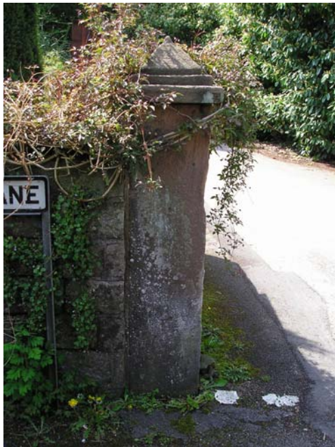
LEFT HAND GATE PIER

On its south side is a double entrance, one to the field behind the cottage and the other to the Oakhill residences. The central gateposts have been removed, making one wide entrance.