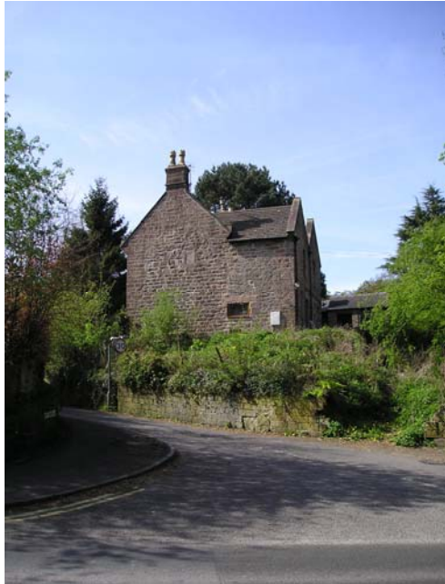
THE FORMER LODGE HOUSE

Early twentieth century OS maps identify the building at the junction of Intake Lane and Derby Road, now known as Lyntree House, as “Lodge House”. A building in this location is shown on the 1841 Tithe Award map. It probably represents a cottage. It seems likely that after 1841-2 this cottage was modified to become a lodge house.