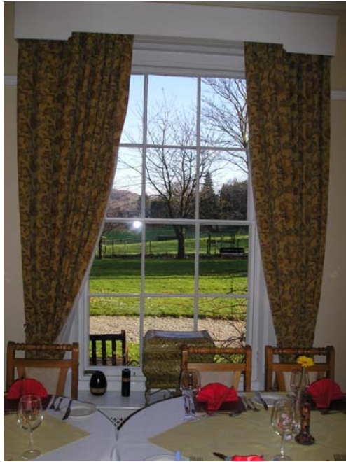
AN EAST FACING WINDOW IN THE FORMER DRAWING ROOM OF OAKHILL

It would seem the principal elevation was originally either the southern or the eastern one. It is difficult to be sure now as the original south front has been lost. The two principal rooms face east, as at the Vicarage, but the sash windows are not the showy Vicarage full height tripartite type, but are conventional six over six sashes, set within ordinary reveals i.e. without architraves. The smaller scale of the ground floor windows in the east wall of Oakhill is compensated for by there being two to light each of the two principal rooms. The room on the southern side is lit by a third, within the south wall. This gives the room a very pleasant quality, which is further enhanced by views down the Derwent Valley, through the two windows in the east wall.