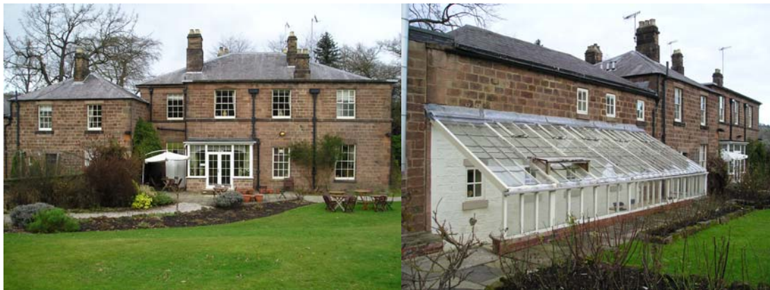
THE SOUTH ELEVATION OF OAKHILL

Attached to the house on its west side is a two storey block, with a pyramidal slated roof and with eaves lower than those of the house. It projects about 16’ 0” beyond the original building-line of the house. Attached to it is a two storey service range, the eaves of which are even lower. Were these perhaps added or extended by the wealthy James Arkwright? The 1880 OS map 21 shows this extensive two storey service range was certainly in existence by then.