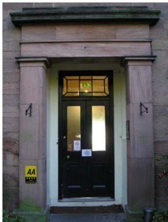
THE ENTRANCE TO OAKHILL

There is just one open window at ground floor level, a 'six over six' pane sash, without horns. Nearly all the windows to the main house are of this type. The sash windows to the first floor have their lintels incorporated within a simple geometric eaves cornice and their sills incorporated in a band course. The entrance door is off centre. It is within a shallow open porch, flanked by Doric pilasters. Within this a small eccentrically designed window lights a small room just to the right of the lobby. The door case has a simple but substantial entablature with a geometric cornice. The front door itself is nicely detailed; a false two leaf pattern, with two panels in each 'leaf', the top ones being tall and glazed. Over the door is a decorative fanlight of three square panes set in margin lights with diagonal glazing bars at the four corners. This joinery is probably original.