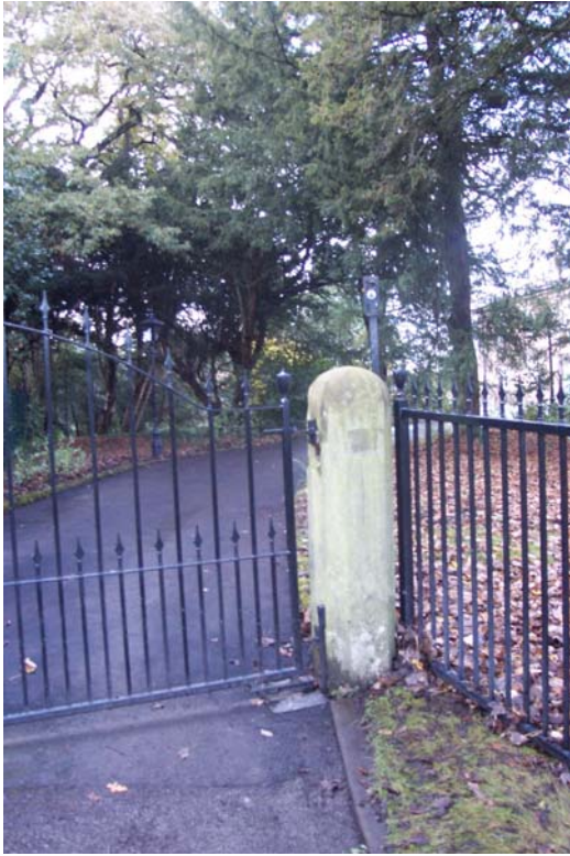
GATE POST TO THE VICARAGE

The carriage drive has square section stone gate posts with chamfered corners commanding the east and west entrance points to the Vicarage garden. Modern metal gates and garden railings were installed in 2008 but they are in the original positions.