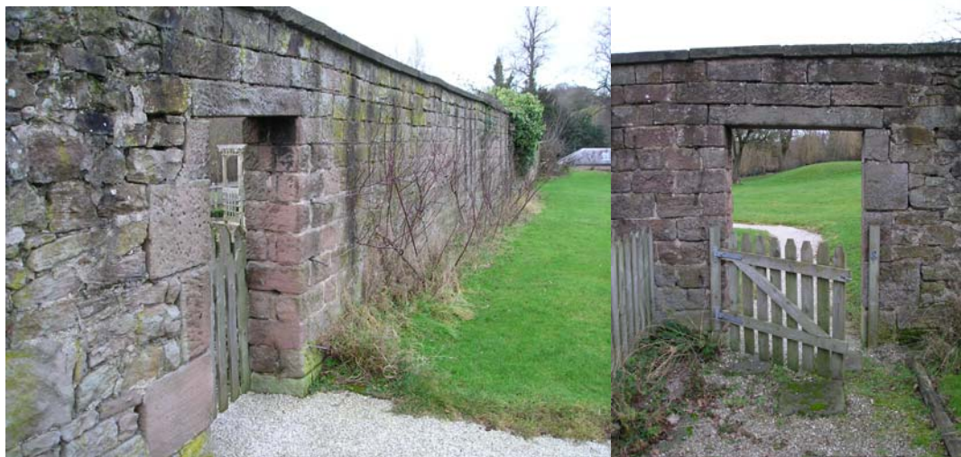
GARDEN WALL AT OAKHILL

The principal garden, on the south side of the house has a tall stone wall bounding it on the west, beyond which, originally, lay a vegetable garden.