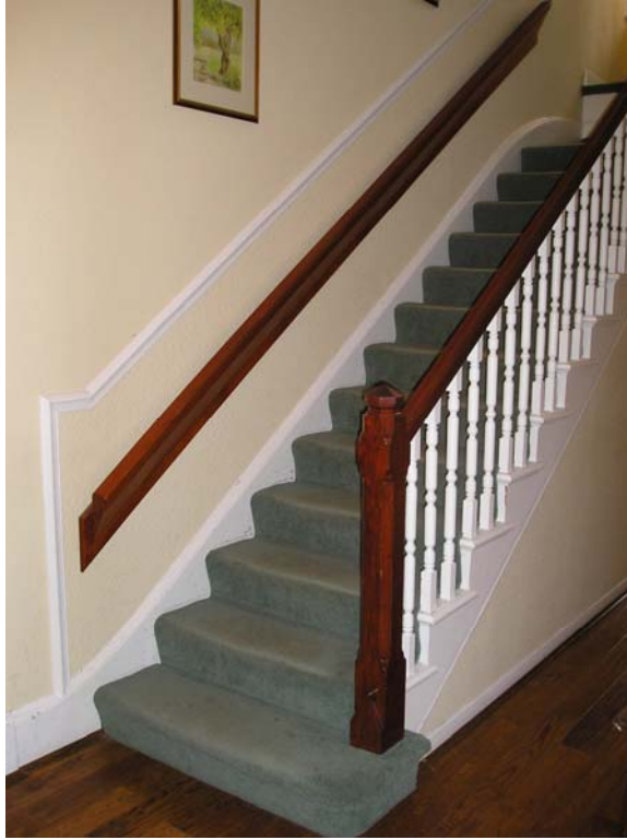
THE STAIRCASE AT OAKHILL

The age and character of the house is much more obviously Victorian when seen from inside, with the doors being four panelled and the staircase having markedly 19 th century style (gothic rather than classical ) newel posts.