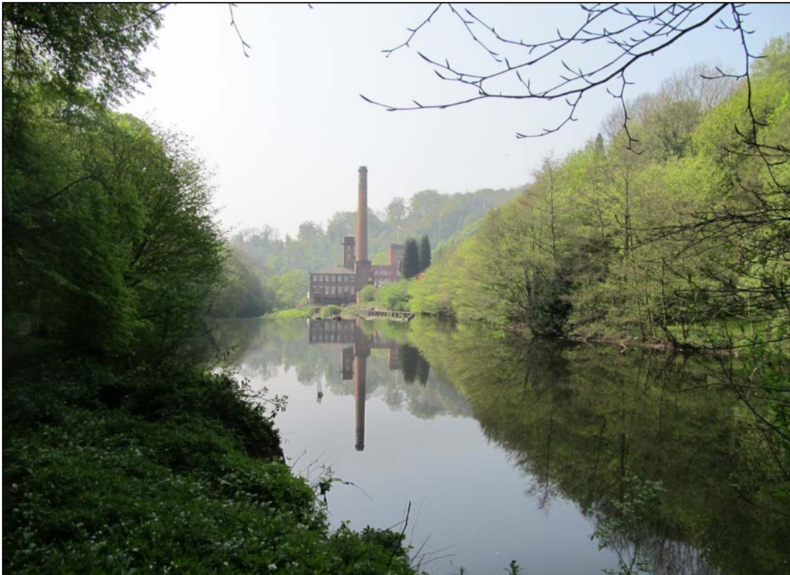
Sir Richard Arkwright's Masson Mills

The annual review features as an appendix the key monitoring indicators identified, in accordance with guidance issued by the International Council on Monuments and Sites (ICOMOS UK), to assist in the production of a Periodic Report, which UNESCO requires be produced for World Heritage Sites at five yearly intervals.