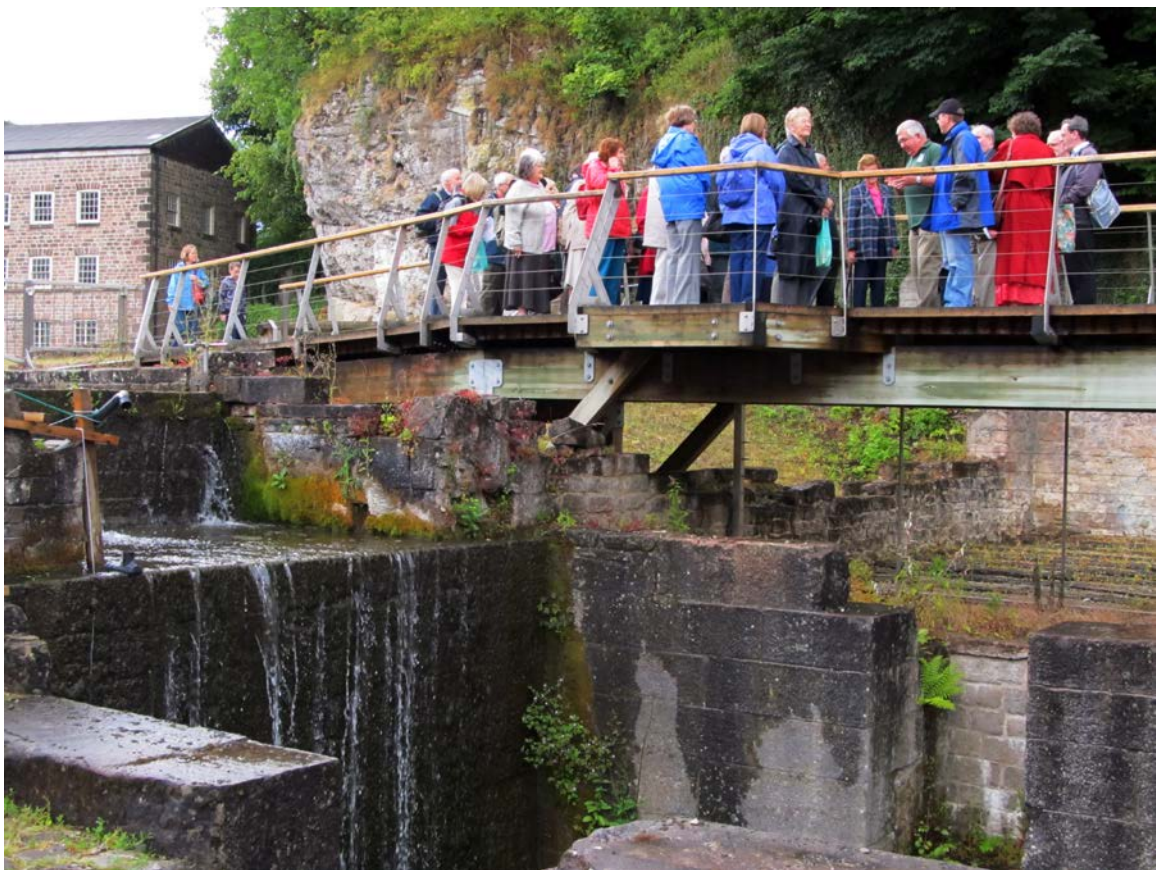
A guided tour of the Cromford Mills site.