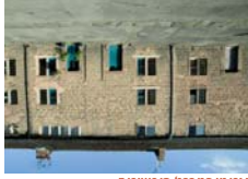
North Street, Cromford