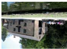
Wharfedale's Wharf, Cromford Canal