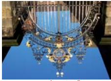
The Silk Mill gears, Derby