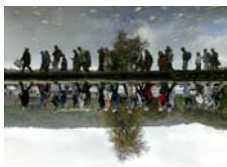
Milling the Cromford Canal