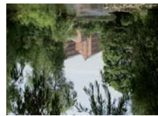
Darley Abbey Mills

Before leaving Belper, take a moment to experience the drama of the horsepower weir that provided power to the mills – an engineering wonder of its day – and discover the town's beautiful River Gardens. Following the river downstream through the historic mill village of Milford, you will arrive at the community of Darley Abbey. Here water power was already in use driving paper, corn, flint and leather mills when, in 1782, the Evans family added their cotton mill and later their factory village. A walk through Darley Park brings you to the southern entrance to the World Heritage Site. Currently closed for re-development, the museum opens for special "pop-up" events. The new Joseph Wright Gallery is a walk away at the Museum & Art Gallery.