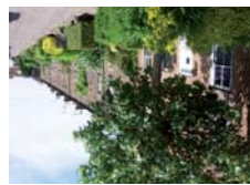
Millworkers' housing in Long Row, Belper