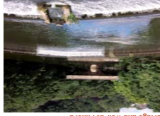
Bridge and weir at Milford