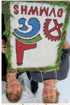
A World Heritage Well Dressing at Cromford

Take a journey back to an age when Britain held centre-stage as the world's first industrial nation – to a place where water power was first successfully harnessed for textile production – a milestone in the Industrial Revolution. Amid breathtaking countryside in the heart of rural Derbyshire, and offering fascinating insights into industrial and social life during the 18th and 19th centuries, the Derwent Valley Mills World Heritage Site is the perfect choice for a summer outing or a winter break. Snaking 15 miles down the river valley from Matlock Bath to Derby, the World Heritage Site contains a fascinating range of historic mill complexes, including some of the world's first modern factories. No less important are the watercourses that powered them, the settlements that were built for the mill workers, and the northern entrance to the World Heritage Site. Established in 1983, and in continuous use until 1991, the mills house a remarkable working textile museum and an adjoining retail village. Experience the sights, sounds and smells of a bygone age; the clatter of well oiled machinery, the whirr of drive belts and wooden floors worn by generations of local millworkers' feet. Millworkers' housing in Long Row, Belper Derwent Valley Mills Derwent Valley Mills World Heritage Site