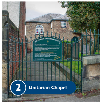
2 Unitarian Chapel

At the top of Joseph Street, cross the road into Field Row . On the left is the Unitarian Chapel , built in 1788 and extended on both sides early in the 19th Century. The chapel is three times its original size. It is a good example of nonconformist architecture. There is a fine external, cantilevered staircase, which gives the only access to the upper gallery. Several members of the Strutt family remains are contained in a catacomb below the Chapel.