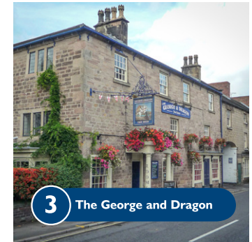
3 The George and Dragon